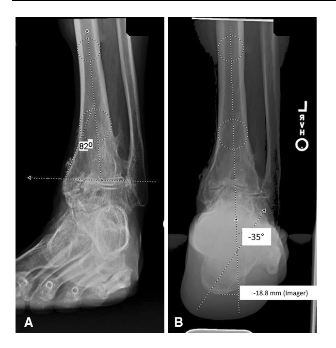
Fig. 3A–B The radiographs of a 66-year-old man without subtalar compensation of the varus tilting tibiotalar joint are shown. (A) His tibiotalar surface angle was 82^{\circ} . (B) The moment arm of the calcaneus was -18.8 mm and the tibiocalcaneal axis angle was -35^{\circ} .