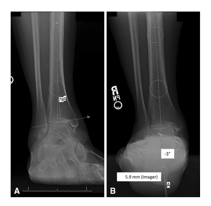
Fig. 2A–B A 61-year-old woman had subtalar compensation of the varus tilting tibiotalar joint. Her ( A ) tibiotalar surface angle was 79°. ( B ) The moment arm of the calcaneus was 5.9 mm and the tibiocalcaneal axis angle was -3^{\circ} .

data describing weightbearing ankle and hindfoot alignment in patients with end-stage ankle arthritis [12, 21]. We therefore (1) compared ankle and hindfoot alignment of our study cohort with end-stage ankle arthritis with those of a control group; (2) explored the frequency of compensated malalignment between the tibiotalar and subtalar joints in our study cohort; and (3) assessed the intraobserver and interobserver reliability of classification methods of hindfoot alignment used in this study.